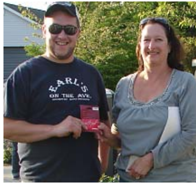
Gift cards were awarded to participants who picked up the most litter