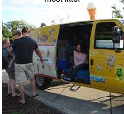
Free ice cream