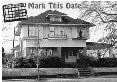
The Historic Van Valey House 2130 Colby Ave.

FYI: the December 8th meeting will be held at the historic Van Valey house. Doors will open at 6:45 p.m. and close at 9:00 p.m.